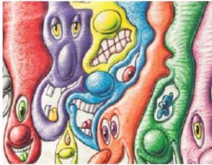
Philly Chew! Book © 2014 Mural Arts Philadelphia / Kerry Scharr. 122 So. 4th (2nd) Street.

Explore the ever-expanding collection of murals in Center City Philadelphia. Discover the impressive collection on your own with the Mural Mile Map, or learn the stories behind the murals with a guided walking tour.